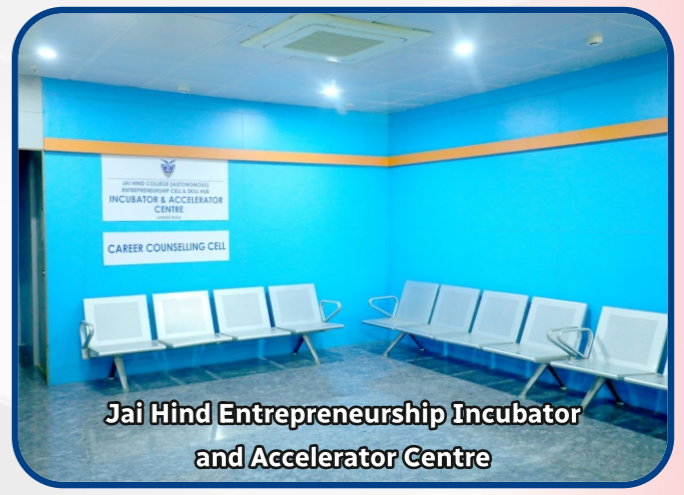
Jai Hind Entrepreneurship Incubator and Accelerator Centre