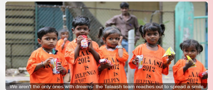
We aren't the only ones with dreams- the Talaash team reaches out to spread a smile