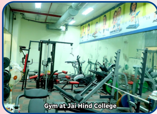
Gym at Jai Hind College