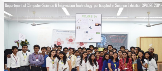
Department of Computer Science & Information Technology participated in Science Exhibition XPLDRE 2014-15