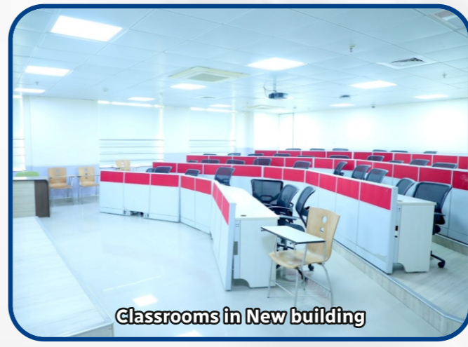
Classrooms in New building