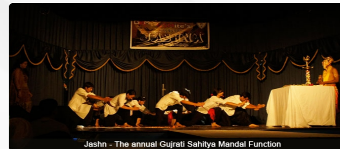
Jashn - The annual Gujarati Sahitya Mandal Function