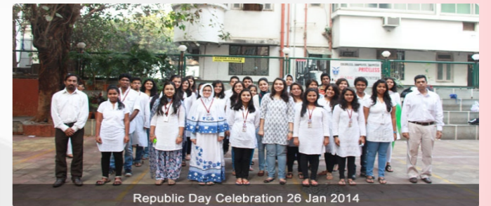
Republic Day Celebration 26 Jan 2014