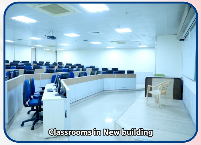
Classrooms in New building