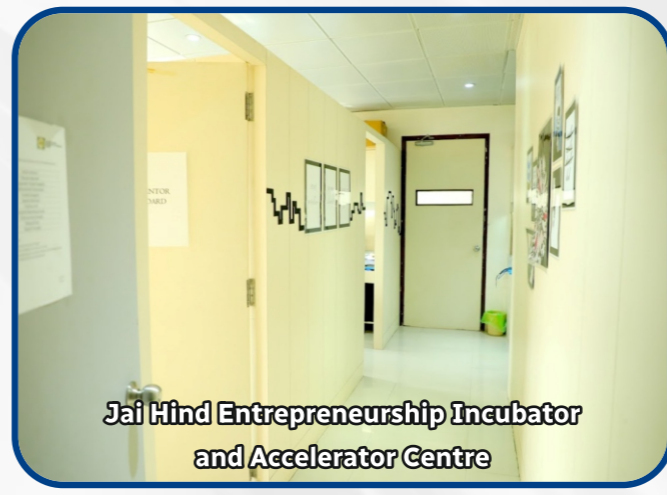
Jai Hind Entrepreneurship Incubator and Accelerator Centre