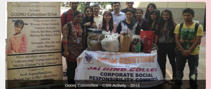
GOONJ Collection Drive A CSR and Economics Association initiative What can you offer? Woolens, Clothes, headlamps, Footwear (in pairs), Utensils, Bed-Sheet, Sewing Machine, Dry-Batter, School materials, Newspapers, One side used sheets, Magazine and Monetary contribution. When and where can you offer? A "collection camp" is being held from the "5th-11th of January" in the "Cafeteria". Contact us at Email: jhcsr@gmail.com Website: Jai Hind - Goony Drive