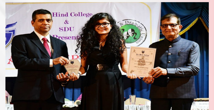
Hind College & SDU Present