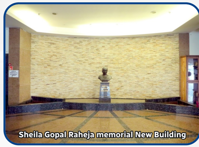
Sheila Gopal Raheja memorial New Building