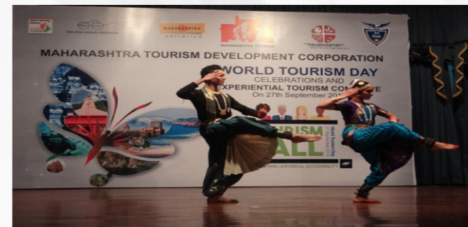
MAHARASHTRA TOURISM DEVELOPMENT CORPORATION WORLD TOURISM DAY CELEBRATIONS AND EXPERIENTIAL TOURISM COMPETITION On 27th September 2014