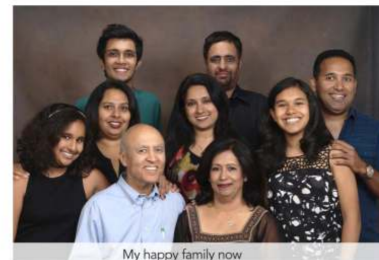
My happy family now

After a few years, the learning bug bit both of us and we both did Masters in