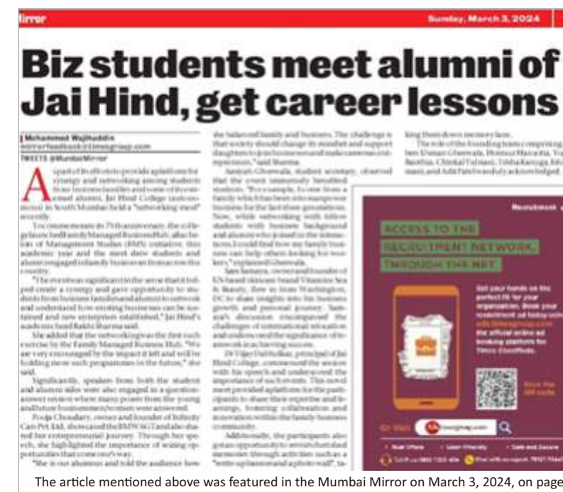
The article mentioned above was featured in the Mumbai Mirror on March 3, 2024, on page 3.

This unique gathering provided a fertile ground for participants to share their expertise and glean insights from one another, fostering a culture of collaboration and innovation within the family business community. Additionally, attendees had the opportunity to reminisce and cherish fond memories through engaging activities such as a write-up banner and a photo wall, adding a nostalgic touch to the occasion.